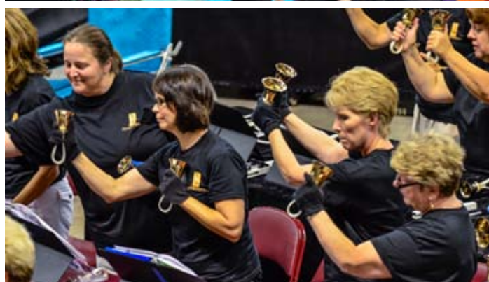
The cha-cha-cha from Jamaican Melody during the final concert.