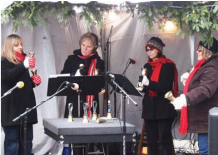
Arbor Bells Quartet played at the Christkindlsmarkt; a German Open Air Christmas market in downtown Excelsior, MN during Thanksgiving weekend.

Area 7 covers a large area. Sometimes we may feel that we are just out there doing our own thing. Maybe other handbell choirs are struggling to keep going, or maybe others are eating up every challenge the director throws at them. What is your choir/ensemble doing? Share it with your Sub Area Chair and we can pass it along to the Clapper Chatter.