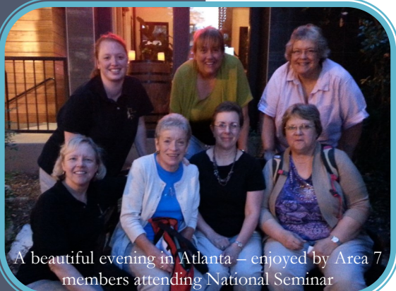
A beautiful evening in Atlanta – enjoyed by Area 7 members attending National Seminar