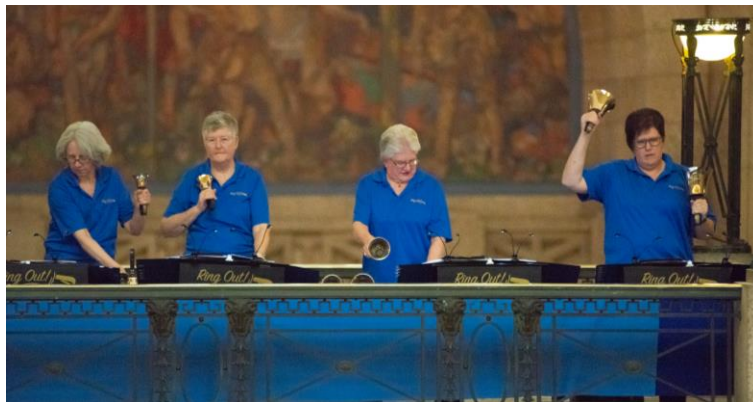
Ring Out! Quartet ringing at Lieutenant Governor's New Year's Day Levee 2019 at the Manitoba Legislature