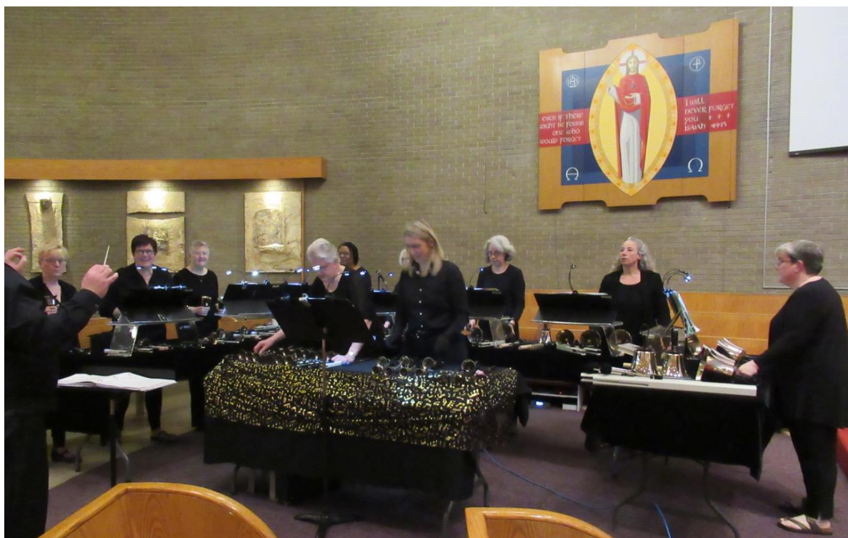
Rochester Ringers in rehearsal at St. John Brebeuf Church