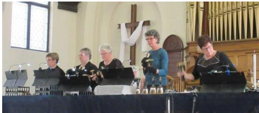
Trinity Lutheran Church Quintet from Starbuck, Manitoba