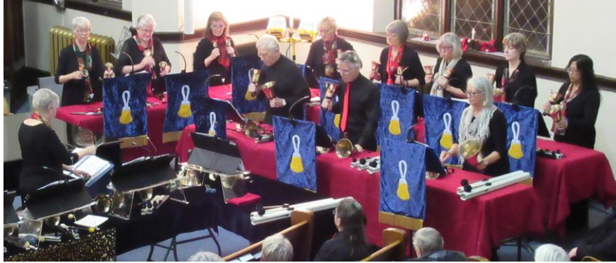
Broadway-First Baptist Handbell Choir in concert on December 15, 2018