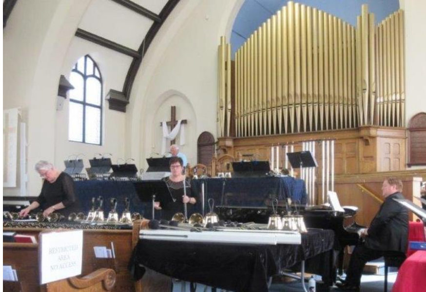
Rochester Trio performs a trio version of Panis Angelicus