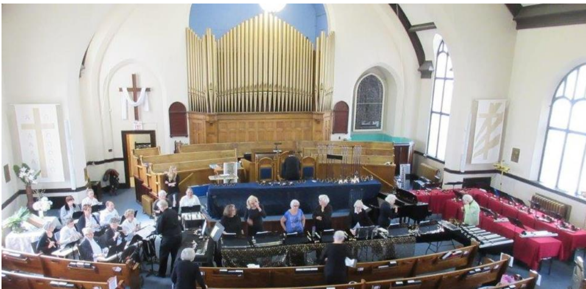
Cheery Chimers and Good Neighbours rehearsing Joyous Celebration for Antiphonal Bells and Chimes