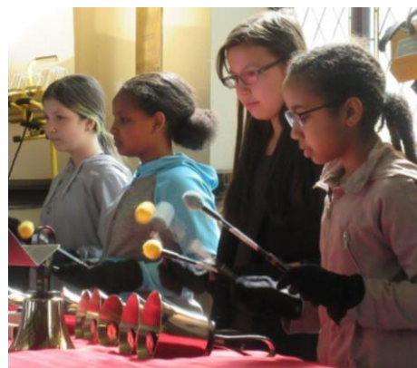
Using mallets in A Simple Pizzicato