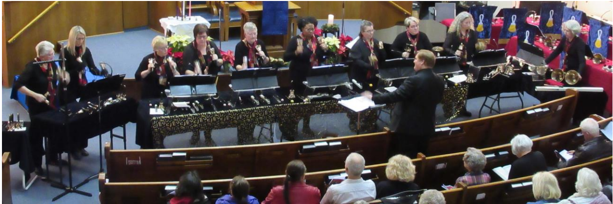
Rochester Ringers performing at Broadway-First Baptist Church on December 15, 2018