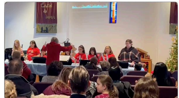
Video of Mobile Hope Chimers. Click on the image to watch from the Area 7 website.

For more information on Area 7's Committee for Handbells In Music Education Grant Program, check out AREA 7 CHIME .