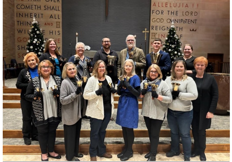
Photo was taken on the First Sunday of Advent, 2023.

reins of the present choir in 2004. The group has grown musically and in numbers under her leadership, and it was during her tenure that the purchase of the 5th octave was completed. A particularly fun activity for the group was providing holiday music in the lobby of the local Hy-Vee supermarket, and several members of the choir recently attended the handbell festival in Watertown, SD. In January they also provided music for the local Sons of Norway chapter.